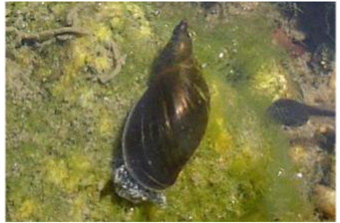
FIGURE 3. Pseudosuccinea columella snail (shell length: 12.86 mm).

with the majority of the local epidemics (Moriena et al. 2008). Not only livestock could be affected, but the important question arises around human health, particularly when considering that La Calera commune is densely inhabited, but also is as far as 20 km from the province's capital with the Suquía river passing through the city. Further researches are required in order to assess about the distribution of this vector snail and its role in the epidemiology of fascioliasis in diverse environments.