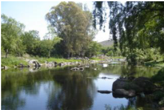
FIGURE 2. Sampling site of Pseudosuccinea Columella in La Calera commune, Córdoba, Argentina.

Thirty-three snails were collected in Suquía river (Figure 2), and 27 shells were analyzed considering standard measures: Shell Length (SL), Shell Width (SW), Last Spire Length (LSL), Aperture Length (AL) and Aperture Width (AW). The SW/SL, AW/AL and AL/SL means were also calculated. On the other hand, a new population was discovered in Cabalango commune (31°23'50.34" S, 64°33'31.19" W), with eleven snails collected (Figure 1). In both sites shells showed all the characteristics of P. columella as described by Hylton Scott (1954), Castellanos and Landoni (1981) and Paraense (1983): tear-shaped shell with a short spire of pointed apex and a large last whorl occupying about three times the length of the rest of the shell (Figure 3), a large and oval aperture, and presence of characteristic minute spiral ridges of the periostracum. Suquía river also harbored the common - snail Physa acuta , Heleobia spp. and Pomacea spp.