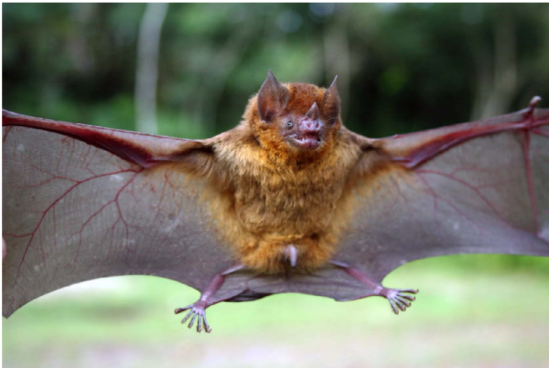
Figure 2. Male Lamproncycteris brachyotis captured in Reserva Natural Morro da Mina , state of Paraná, Brazil.

The specimen (Figure 2) has all characters reported to L. brachyotis (Sanborn 1949; Medellín et al. 1985; Genoways and Williams 1986; Nogueira et al. 2007): dorsal fur orange brown, with pale orange basis; head, face and throat bright orange; ventral fur pale orange; ears, wings and interfemoral membranes dark brown; calcar longer than foot; pinnae short and with pointed tips; interauricular band absent; third metacarpal longest, fifth shortest; second phalanx of wing digits III and V longer than first; orbital foramen between the second upper premolar and the first molar; first pair of upper incisors chisel-shaped and in line with canines; second pair of upper incisors bifid, with more elongated inner cusp, and in contact with central incisor; second lower premolar reduced relative to both first and third, which are subequal in size.