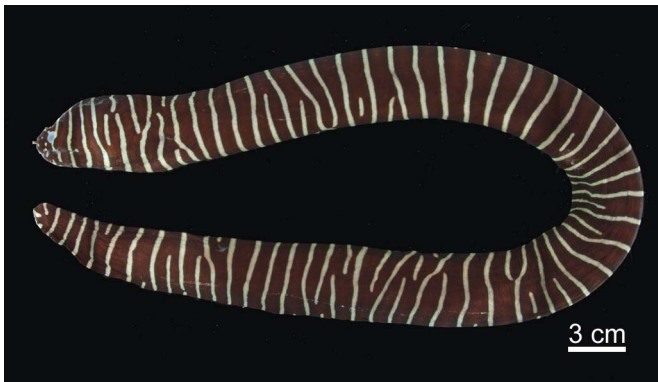
FIGURE 3. Moray eel Gymnomuraena zebra (Shaw, 1797), photograph of a dead specimen before fixation, collected from the same locality and habitat in Okinawa, Japan, as RUMF-ZN-00001, here identified as Baseodiscus mexicanus (Bürger, 1893). This specimen of G. zebra was dissected and processed during another study, and no voucher remains.

Baseodiscus mexicanus exhibits a remarkable resemblance to the zebra moray eel, Gymnomuraena zebra (Shaw in Shaw and Nodder, 1797) (Actinopterygii: Anguilliformes: Muraenidae) (Figure 3), possibly indicating a relationship of mimicry. Near Cape Manza in Okinawa, B. mexicanus and G. zebra occur in exactly the same habitat, with the latter species much more abundant (Uyeno, pers. obs.). The distributions of these two species broadly overlap; the moray eel is distributed from the Red Sea and eastern African coast to the Society Islands, north to the Ryukyu and Hawaiian Islands, and south to the Great Barrier Reef (Fricke 1999); it also occurs in the central eastern Pacific: along southern Baja California, Mexico; and from Guatemala to northern Colombia, including the Galapagos (McCosker and Rosenblatt 1995). Future investigations of the ecology and toxicology of these animals may shed light on a possible coevolutionary relationship between them.