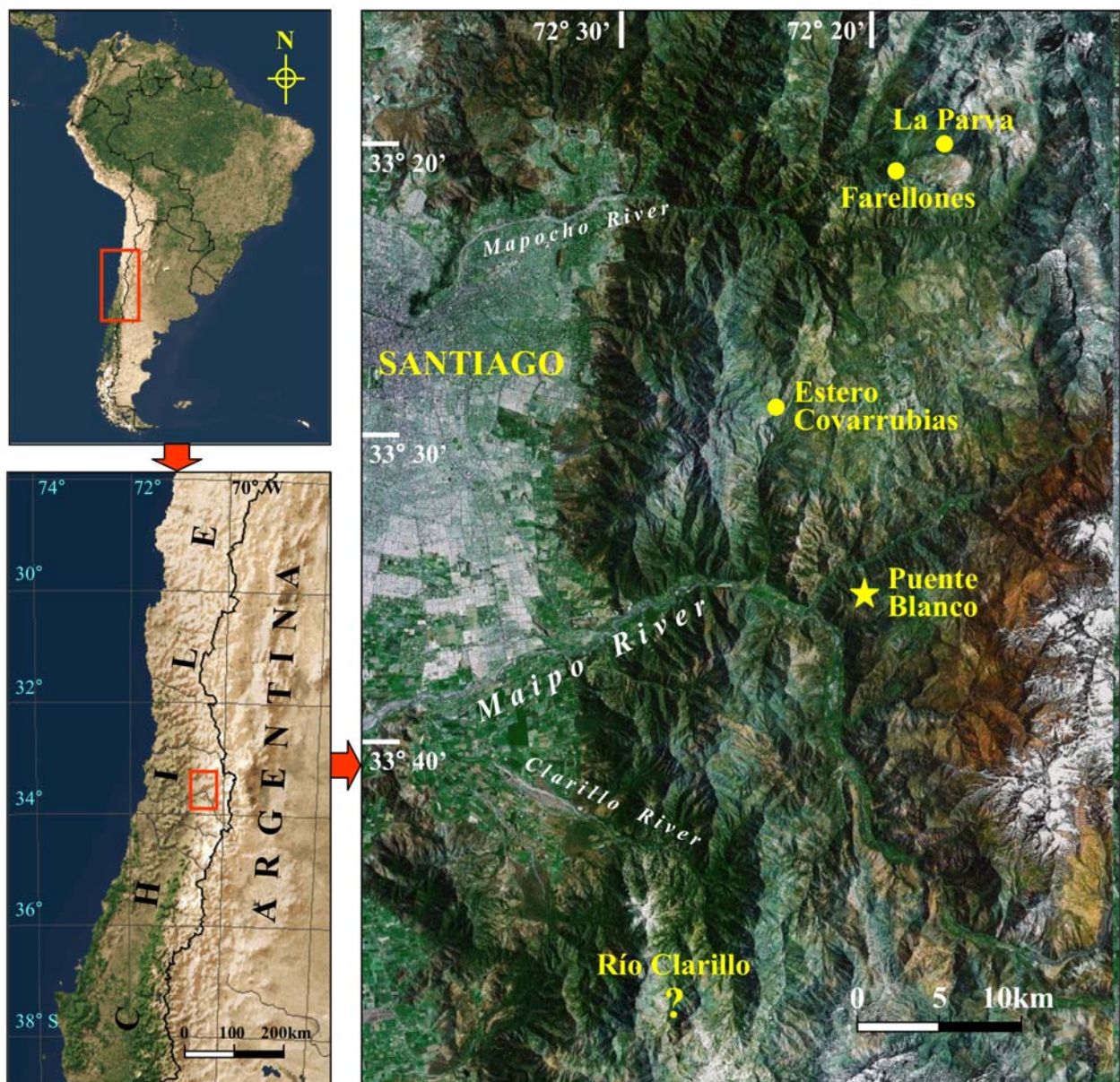
Figure 1. Distribution map of Alsodes montanus showing all localities cited in the literature and the new locality, Puente Blanco, described in this report. The question mark represents the locality whose exact location is unknown.

The new locality, Puente Blanco (33°37'58.9" S, 70°19'00.2" W, 1455 m), is 32 km south of Farellones and about 30 km southeast of Santiago (Figures 1 and 2).