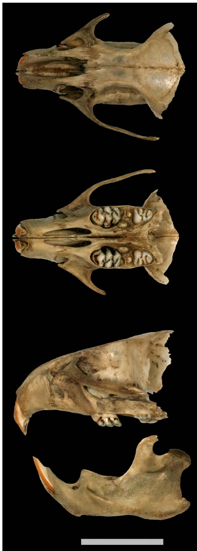
FIGURE 2. Remains of Holochilus brasiliensis found 20 km S of Pedro Luro on Hwy 3 (Buenos Aires province, Argentina). From top to bottom, anterior fragment of skull in dorsal, ventral, left lateral, and mandible in labial view. Scale bar = 10 mm.