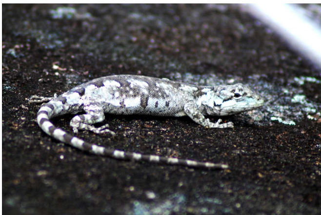
FIGURE 1. Urostrophus vautieri , in life, from Pedra Azul, municipality of Domingos Martins, state of Espírito Santo, Brazil.