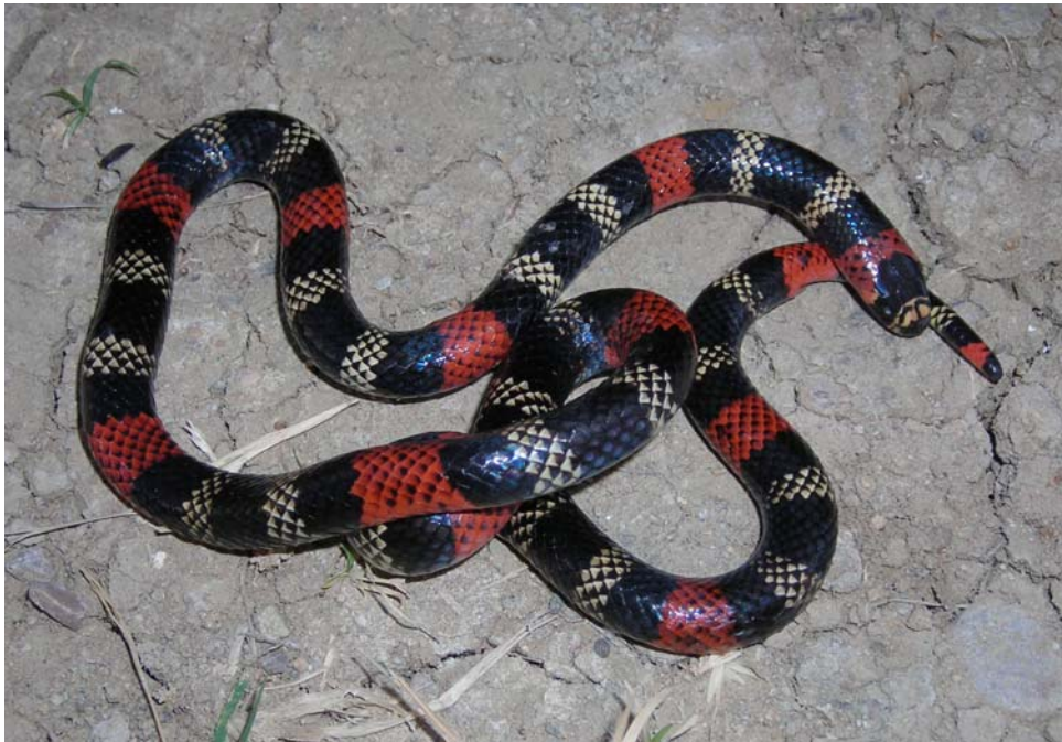
Figure 1. Specimen of Micrurus serranus (MHNC-R 130) from El Vergel Parque Nacional Torotoro , Potosí, Bolivia.