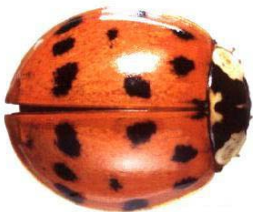
FIGURE 2. The succinea colour form of Harmonia axyridis .

The color pattern H. axyridis adults found in Viçosa is the succinea (Figure 2). The elytra coloration varies from yellow to red, with 0 to 21 black spots. The color may vary according to geographic distribution of the population, which is mainly related to climate factors (Soares et al. 2005). The succinea phenotype is generally associated to boreal forest, temperate broadleaf and mixed forest, temperate coniferous forest and tropical-subtropical moist broadleaf (Koch et al. 2006).