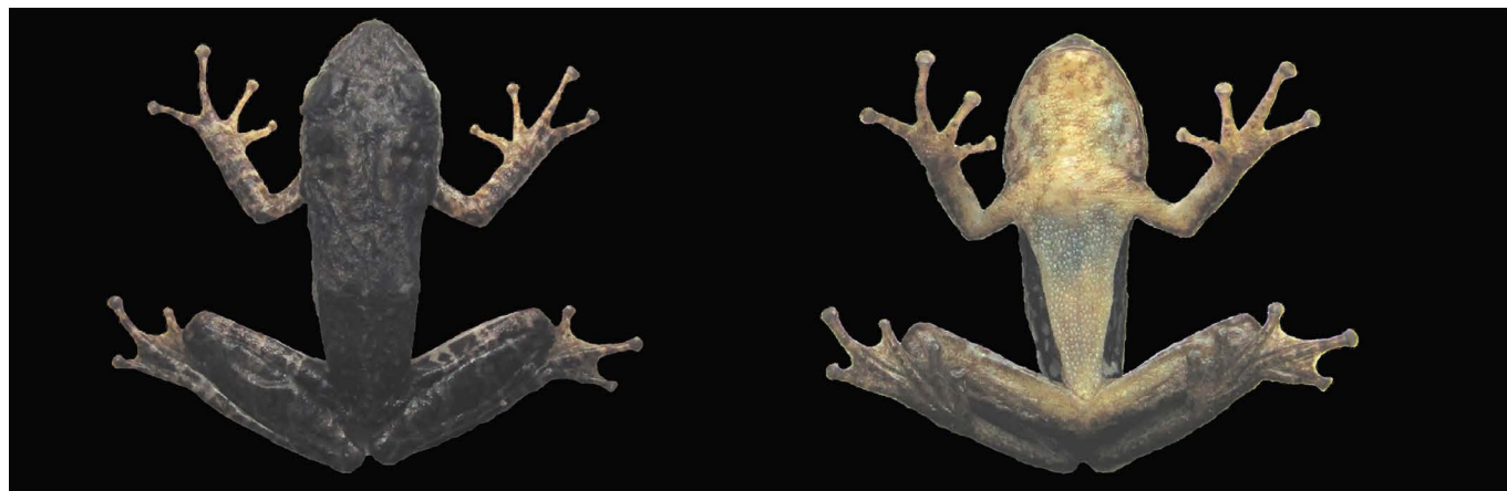
FIGURE 2. Dorsal (A) and ventral (B) view of an adult female Scinax centralis (MZUFV 6511, 26.55 mm snout-vent length) from Campo Alegre de Goiás, state of Goiás, Brazil.