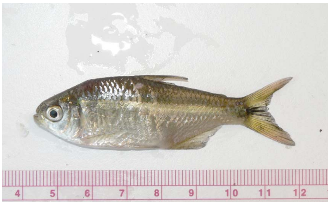
Figure 2. Astyanax pampa , 60 mm SL, from Chimpay, Río Negro province, Argentina.