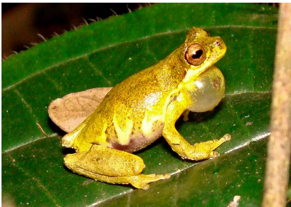
Figure 1. Dendropsophus microps from Avaré, state of São Paulo, Brazil.