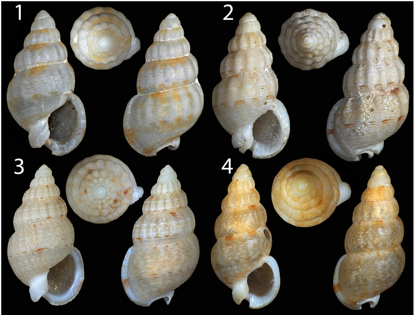
FIGURES 1-4. Nassarius karinae (Minerva Seamount, off Bahia state, Brazil, 17°06' S, 37°38' W; MZSP 110917) conchological variation. 1. Length = 8.4 mm, width = 4.3 mm; 2. Length = 8.7 mm, width = 4.5 mm; 3. Length = 8.6 mm, width = 4.5 mm; 4. Length = 10.8 mm, width = 5.3 mm.

1826) (which is reported as having 2 nuclear whorls by Usticke (1971) and Faber (2004), though Rios (2009) mentions 1½ nuclear whorls); however, most authors did not stipulate the whorl-counting method, which could lead to inconsistent whorl numbers (e.g., Pilsbry's (1939) versus Verduin's (1977)). The minute shell size, the spiral sculpture with evenly spaced thin lines throughout the teleoconch, protoconch outline and the presence of a faint (often interrupted) brownish spiral band are invariable features in all specimens, and compare fittingly with the original description.