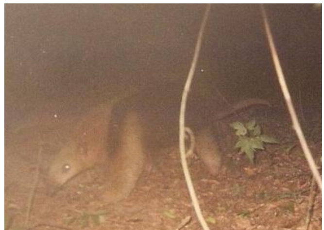
FIGURE 2. Tamandua tetradactyla recorded by camera trap at the coastal plain of the state of Rio Grande do Sul.