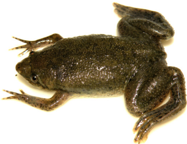
FIGURE 1. Pipa carvalhoi (C00177), State Conservation Unity Monumento Natural Grota do Angico, state of Sergipe, Brazil.

We report the first record of Pipa carvalhoi (Figure 1) for the state of Sergipe, Brazil. The observation occurred on February 25, 2011, in the State Conservation Unit Monumento Natural Grota do Angico (9°39'50" S, 37°40'57" W; 200 m above sea level) (Figure 2), municipality of Poço Redondo. The specimen of Pipa carvalhoi (SVL: 38.16 mm) was collected in a temporary pond in an anthropic environment, with many grasses, near a rocky outcrop. The collected specimen was fixed in 10% formalin and preserved in 70% alcohol, and deposited in the Herpetological Collection of the Universidade Federal