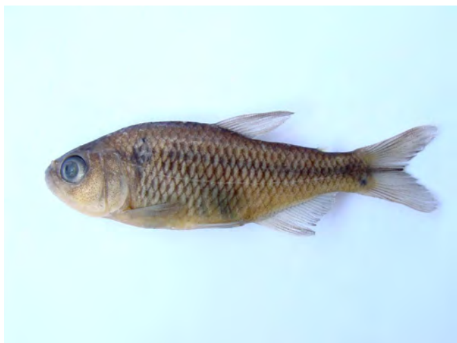
FIGURE 1. Lateral view of Astyanax turmalinensis , DZUFMG 024, 43.1 mm SL.

Astyanax turmalinensis Triques, Vono and Caiafa, 2003, was described from upper Jequitinhonha River basin, the type locality being the Divisão stream, right bank tributary of Jequitinhonha River, at Peixe-Cru village, municipality of Turmalina, state of Minas Gerais, Brazil. The Serra do Cipó comprises part of Espinhaço Mountain Chain in central Minas Gerais state. The Cipó River gives name to the Parque Nacional da Serra do Cipó (Serra do Cipó National Park) and is a right bank tributary of Velhas' River, which is a right bank tributary of São Francisco River. The first inventory of the fish fauna of the Parque Nacional da Serra do Cipó (from now on mentioned as PNSC) was done by Vieira et al. (2005), including a map of the area and a list with 48 species. Triques (2006) included two other species in the PNSC list of fish species. We have collected specimens of Astyanax (Figure 1) from both São Francisco River and Doce River basins (Figure 2) inside the PNSC, not previously identified to species level, and a detailed morphological study indicated that they belong to Astyanax turmalinensis .