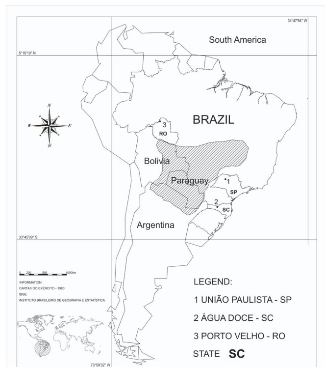
FIGURE 1. New record of Phyllomedusa azurea in the (1) municipality of União Paulista, state of São Paulo (Prado et al. 2008), (2) municipality of Água Doce, state of Santa Catarina (present study), and (3) municipality of Porto Velho, state of Rondônia (Calderon et al. 2009). The stripped area corresponds to the species geographic distribution proposed by Angulo (2008).

The type locality of P. azurea is unknown, mentioned simply as 'Paraguay' in original description. Its occurrence is recorded in the regions of Chaco, east of Bolivia, from Paraguay to northern Argentina, Cerrado and Pantanal in Central Brazil in the states of Mato Grosso, Mato Grosso do Sul, Tocantins, Goiás, Distrito Federal, Minas Gerais and São Paulo (Caramaschi 2007 "2006"; Prado et al. 2008; Frost 2009), and recently from a transitional region between the Cerrado and the Amazonian Forest biomes in state of Rondônia, in northern Brazil (Calderon et al. 2009). This species is typical from open habitats. During its reproductive season it can be found mainly in swampy