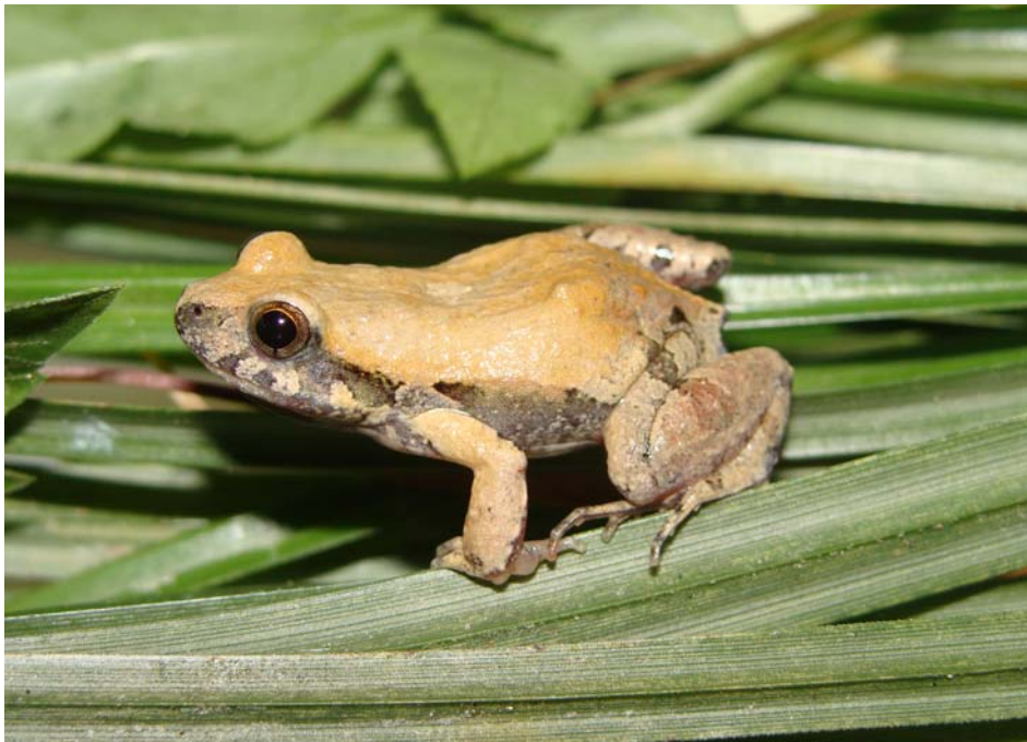
Figure 1. Adult male of Physalaemus cicada collected in the municipality of São José da Tapera, state of Alagoas, northeastern Brazil.

Voucher specimens were deposited at the herpetological collection of the Museu de História Natural, Universidade Federal de Alagoas , Brazil (MUFAL 7466-7471).