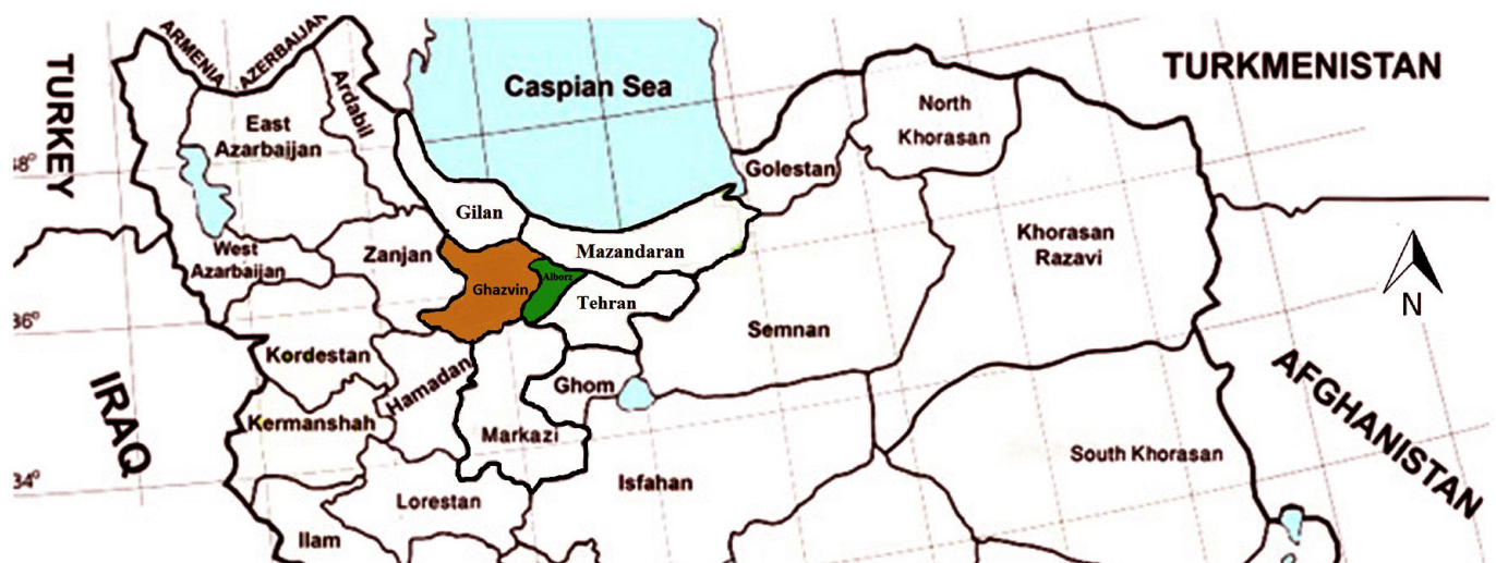
FIGURE 1. Iran- Alborz and Ghazvin provinces, where the Amictus pictus specimens have been collected.

New materials were collected from different habitats of the northern Iran using malaise traps during 2010 and 2011 (Figure 1). Samples were collected between March and November 2010 and 2011. The specimens were extracted from the malaise traps and sorted weekly. Specimens were dehydrated in 99.6% ethanol for 5-10 minutes and then placed in a pure solution of hexamethyldisilazane (HMDS) for 15-20 minutes. The specimens finally placed in a glass plate for drying and then were labeled. The species were identified using the keys provided by Greathead and Evenhuis (1997), Zaitsev (1966) and Engel (1932). Female genitalia preparations were made by macerating the apical portion of abdomen in cold 10% KOH for 14- 15 hours, and then washed with distilled water and transferred to fresh glycerin to study. All specimens are deposited in the