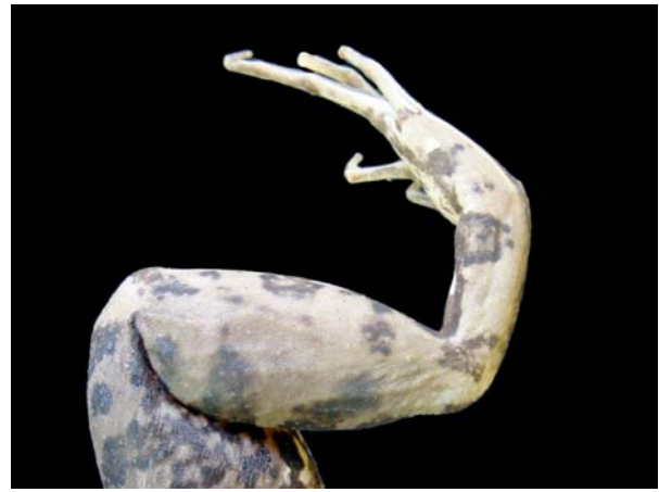
Figure 2. Detail of the leg of a Leptodactylus viridis specimen (MZUFV 5460) from Fazenda Santana , municipality of Salto da Divisa, Minas Gerais, Brazil. Note the light spiculae on longitudinal lines, characteristic of this species.

Leptodactylus viridis is currently defined as Data Deficient by the IUCN redlist (IUCN 2009). The record of L. viridis from municipality of Salto da Divisa represents the first record of this species in the state of Minas Gerais and the westernmost register, 210 km southward Itagibá (type locality) and 60 km northwestward Guaratinga (Figure 3). The collected specimen was found near a temporary pond in open habitat, an environment similar to that reported in the description of the species.