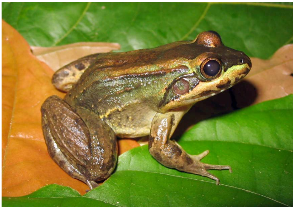
Figure 1. Adult live male of Leptodactylus viridis from Fazenda Santana, municipality of Salto da Divisa, state of Minas Gerais, Brazil.