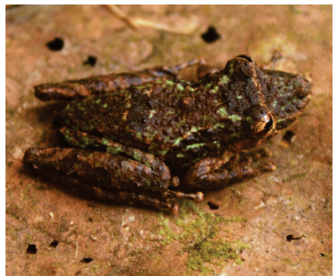
FIGURE 1. Adult male of Scinax garbei from the municipality of Serra do Navio, Amapá state, Brazil.

During fieldwork on July 25 th 2012, at 21:30h, in Parque Natural Municipal do Cancão (0.911833° N, 52.002056° W, datum: WGS84), municipality of Serra do Navio, state of Amapá, males of Scinax garbei were found calling under the marginal vegetation of ponds. The Parque Natural Municipal do Cancão was created in 2007 and has an area of 370.26 ha of Amazon forest. The locality presents transitional vegetation between the Cerrado and Amazonian Domains with permanent and temporary ponds during the rainy season that extends from February to June (Drumond et al. 2008). At the same pond the following species were calling: Dendropsophus leucophyllatus (Beireis, 1783), Hypsiboas cinerascens (Spix, 1824), H. multifasciatus (Gunther, 1859"1858"), Phyllomedusa hypochondrialis (Daudin, 1800) and Scinax nebulosus (Spix, 1824).