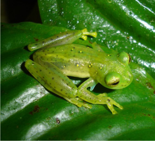
FIGURE 2. Espadarana prosoblepon male, SVL 23 mm, from Barbas river basin, municipality of Filandia, Quindío.