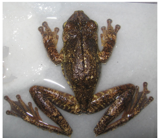
FIGURE 1. Dorsal view of Hypsiboas exastis (voucher specimen CHURPE603).

The new record extends the geographical distribution of H. exastis in approximately 70 km to the northeast. Although H. exastis has only been recently described and is known from few locations, it is probably present in isolated populations in other forest fragments in the central and