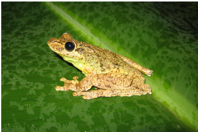
FIGURE 3. Adult Hypsiboas exastis , municipality of Ibateguara, state of Alagoas, Brazil.

northern Atlantic forest. Suitable habitats may still persist in the largest forested areas of the state of Alagoas and in the eastern part of the state of Pernambuco (Carnaval and Peixoto 2004). The few records are potentially explained by a lack of inventories and published observations, particularly in Atlantic forest areas of extreme northeastern Brazil. The Coimbra forest represents one of the last large fragments in the Atlantic forest north of the São Francisco River (Melo et al. 2006) that sustain a wide variety of appropriate habitats for amphibians, including streams, ponds and fields of terrestrial bromeliads. However, this is the first survey of the amphibian fauna for the area.