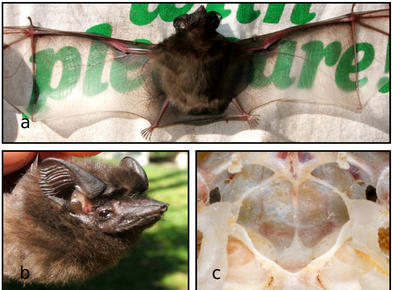
FIGURE 2. Photograph of the subadult female Peropteryx leucoptera (QCAZ 8478) demonstrating (a) the white transparent wing membranes beyond the forearm, (b) band across the forehead connecting the ears, and (c) large pterygoid pits at the base of the skull.