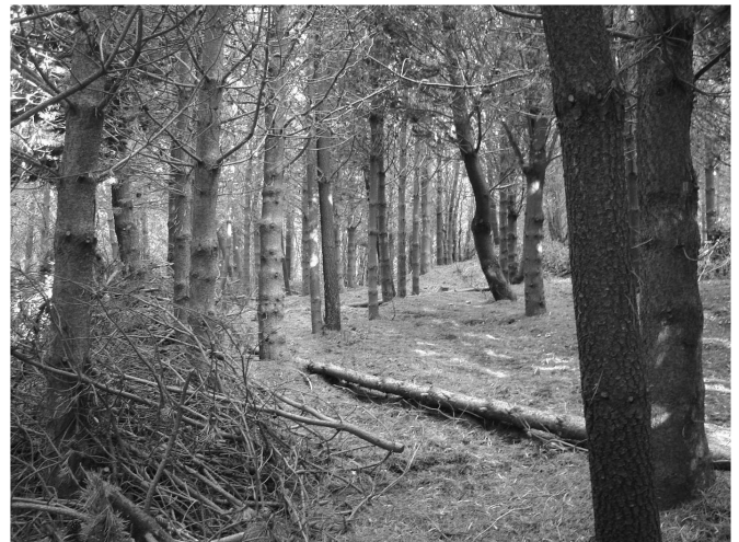
FIGURE 2. Pinus contorta plantation where the Irenomys tarsalis and Geoxus valdivianus specimens were found in Coyhaique National Reserve, Aysén.

In addition, the discovery of a specimen of Irenomys tarsalis and another of Geoxus valdivianus on a Pinus contorta forestry plantation helps broaden our understanding of the region's natural history. These records highlight our limited knowledge of this fauna and show the need to carry out additional field work and implement monitoring efforts that include disturbed and non-native habitats, which are dramatically increasing in area in Chile.