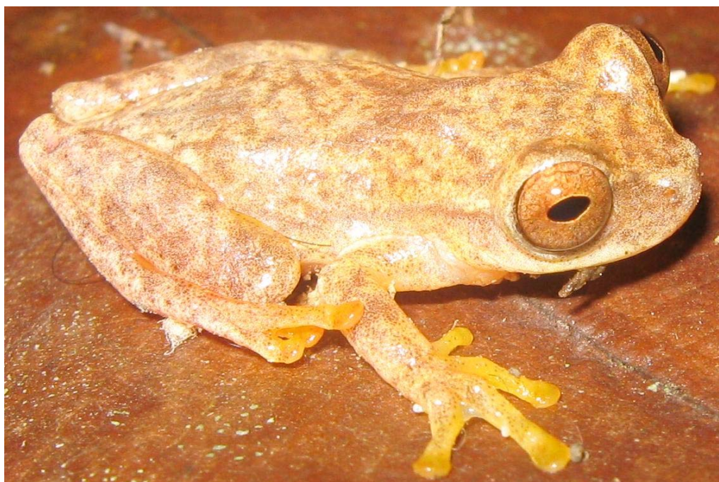
Figure 2. An adult male of Dendropsophus microcephalus (UV-C 15708) from Reserva Forestal San Cipriano y Escalere , municipality of Buenaventura, Colombia.

Dendropsophus microcephalus has been reported as a species able to occur in disturbed areas (Duellman 1970; Bolaños et al. 2004). These observations are consistent with the present report, because the two specimens collected by us were found calling on the vegetation, close to road and human constructions. Moreover, while the field work was being carried out, specimens only were found active during and after rainfall.