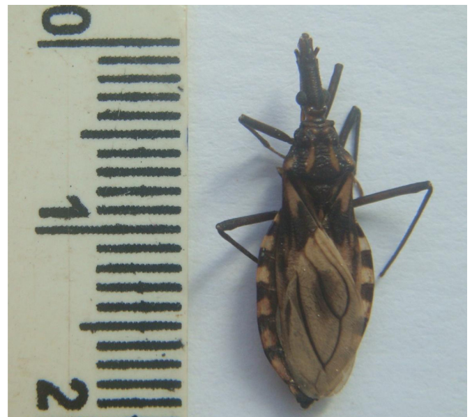
FIGURE 1. Triatoma petrocchia specimen (female) from municipality of Ipaumirim, state of Ceará, Brazil.

The updated geographic distribution map of T. petrocchia (Figure 2) presents the known records in the