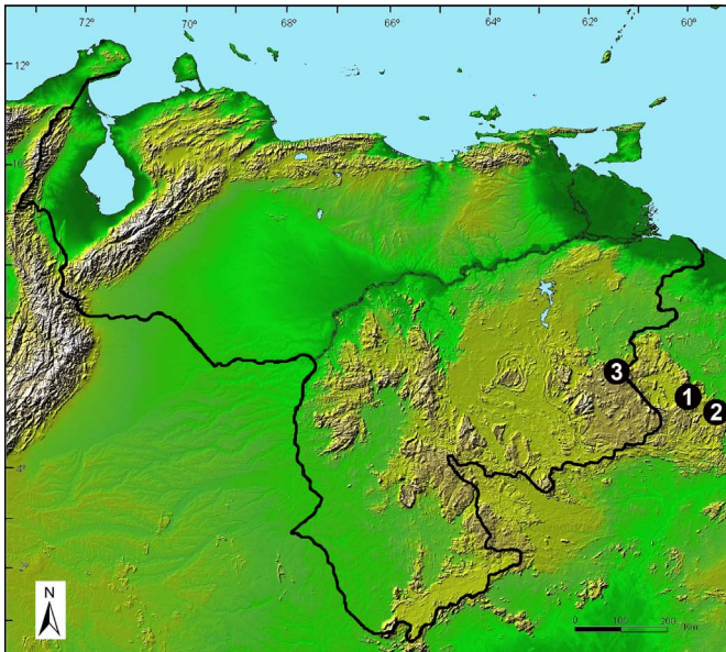
FIGURE 2. Known distribution of Osteocephalus exophthalmus . 1: type locality: 30 km SE Imbaimadai, Mazaruni-Potaro District, Guyana. 2: Kaieteur Falls, Guyana. 3: locality reported herein.

nocturnal and arboreal, and is found in primary forest not very far from water. Our specimens are adult males with keratinized nuptial pads with snout-vent lengths ranging from 27.8 to 32.8 mm. The specimens were collected at the edge of a forest pond, between 100 and 140 cm from the forest floor (neither was vocalizing). The altitudinal