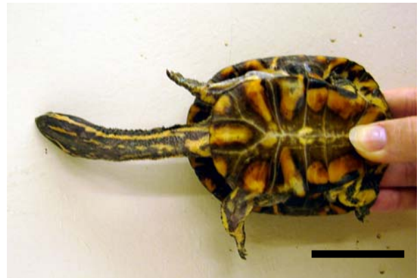
Figure 1. Ventral view of juvenile H. tectifera collected at the municipality of Ritápolis, Minas Gerais state (scale bar = 5 cm).

On 26 July 2006, one juvenile of H. tectifera (Figure 1-2) (carapace length = 112.4 mm, body mass = 165 g) was hand-captured, photographed and released in the Ritápolis (21°00'02.42" S, 44°18'16.09" W, 1051 m above sea level), southeast of state of Minas Gerais, Brazil, inside in the cerrado biome.