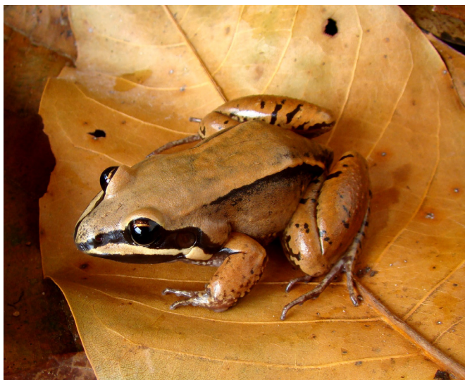
FIGURE 1. Adult male of Leptodactylus cupreus (MBML 6844) from municipality of Santa Teresa, state of Espírito Santo, Brazil.

Leptodactylus cupreus (Figure 1) belongs to the L. fuscus species group and is related to the L. mystaceus complex, being characterized by the large size for the group and color pattern (Caramaschi et al. 2008). Leptodactylus cupreus has a non-pulsed advertisement call with a rate of about 12 calls/s and dominant frequency between 2,800 and 3,058 Hz (Caramaschi et al. 2008). Its call is similar to the call of birds, as an example to the song of Russet-winged-Spadebill, Platyrinchus leucoryphus Wied, 1831, (Tyrannidae) (Rupp 2009).