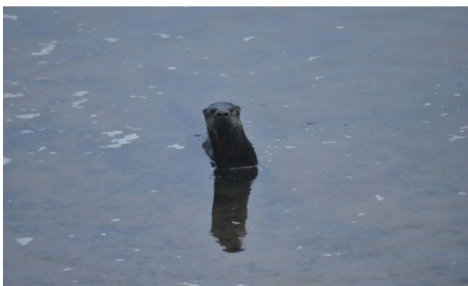
FIGURE 3. Lontra longicaudis specimens registered in the Massaguaçu estuary, Caraguatatuba municipality, state of São Paulo.

Five-hundred years ago, the São Paulo state had approximately 83 % of its territory covered by Atlantic Rain Forest and Cerrado physiognomies, but today possesses only 13 % of its original cover (Biota/Fapesp 2008). The Massaguaçu estuary is located in one of the last large remnants of the Atlantic Rain Forest, the Serra do Mar region. As suggested by Quadros and Monteiro-Filho (2002), otter populations present in the Atlantic Forest plain closer to tourist centers are especially susceptible to human activities. Accordingly, the Massaguaçu estuary is not a protected area and the human occupation in its margins tend to increase over the years, what may constitute a threat to the otter population maintenance.