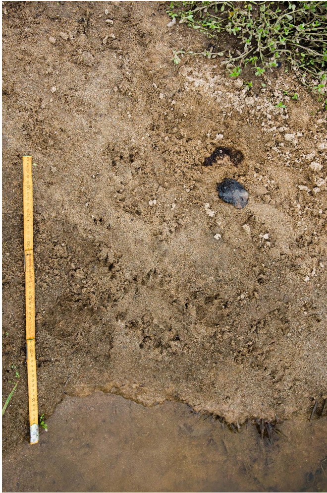
FIGURE 2. Otter footprints and feces registered in the Massaguaçu estuary, Caraguatatuba municipality, state of São Paulo.

Five-hundred years ago, the São Paulo state had approximately 83 % of its territory covered by Atlantic Rain Forest and Cerrado physiognomies, but today possesses only 13 % of its original cover (Biota/Fapesp 2008). The Massaguaçu estuary is located in one of the last large remnants of the Atlantic Rain Forest, the Serra do Mar region. As suggested by Quadros and Monteiro-Filho (2002), otter populations present in the Atlantic Forest plain closer to tourist centers are especially susceptible to human activities. Accordingly, the Massaguaçu estuary is not a protected area and the human occupation in its margins tend to increase over the years, what may constitute a threat to the otter population maintenance.