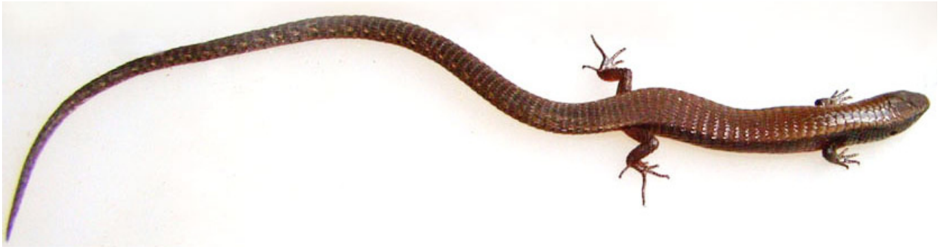
FIGURE 1. Colobosaura modesta (ca. 35 mm SVL, CHBEZ 3758) from the Chapada do Araripe, municipality of Crato, state of Ceará, Brazil.