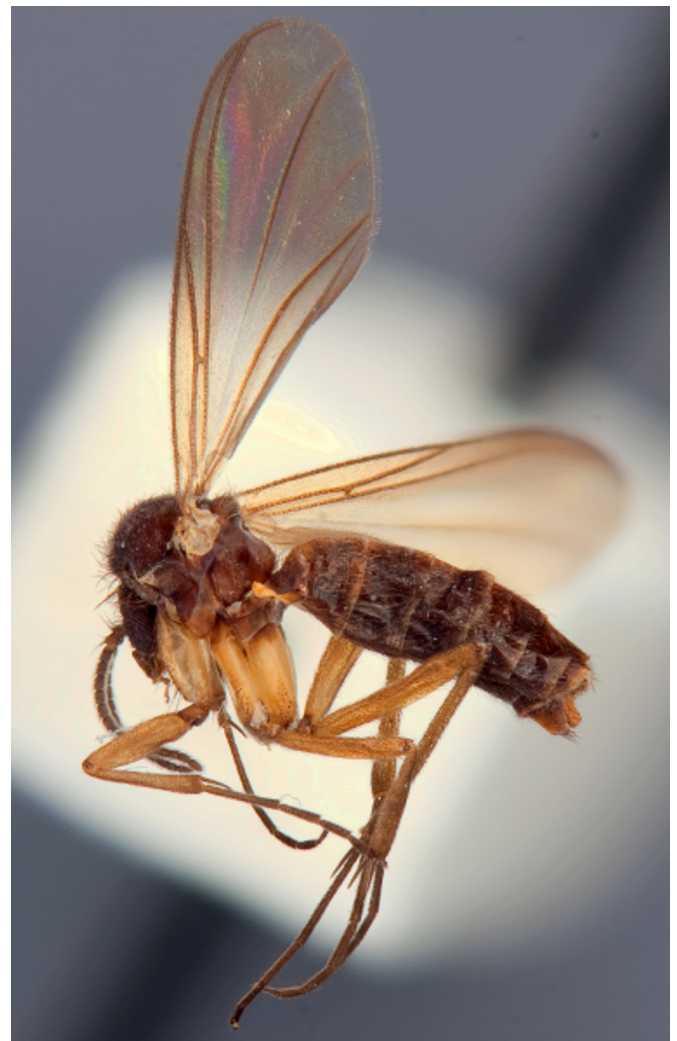
FIGURE 1. Left habitus of male Azana sinusa , Walterboro, SC, 4.iii.1989.

Current distribution: Maine south to South Carolina west to the Appalachian Mountains. These specimens represent a range extension of ~1200km for the species,