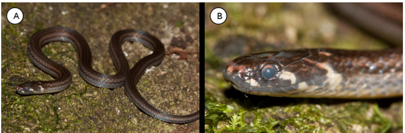
FIGURE 1. Photograph of Trimetopon barbouri collected and released by JDW in El Valle de Antón, Coclé Province, Republic of Panama (Locality 1) in January 2012 (UTADC 7633). A. full body view B. head view.

Given the seemingly secretive nature of this species of leaf litter snake, the abundance and full geographic distribution is unknown. These records extend the known range to ca. 116 km (straight line distance) west of the type locality and ca. 70 km west of the formerly westernmost locality at Parque Nacional Altos de Campana. Future surveys of the leaf litter and fell logs likely will turn up additional specimens of this poorly known species and its congeners.