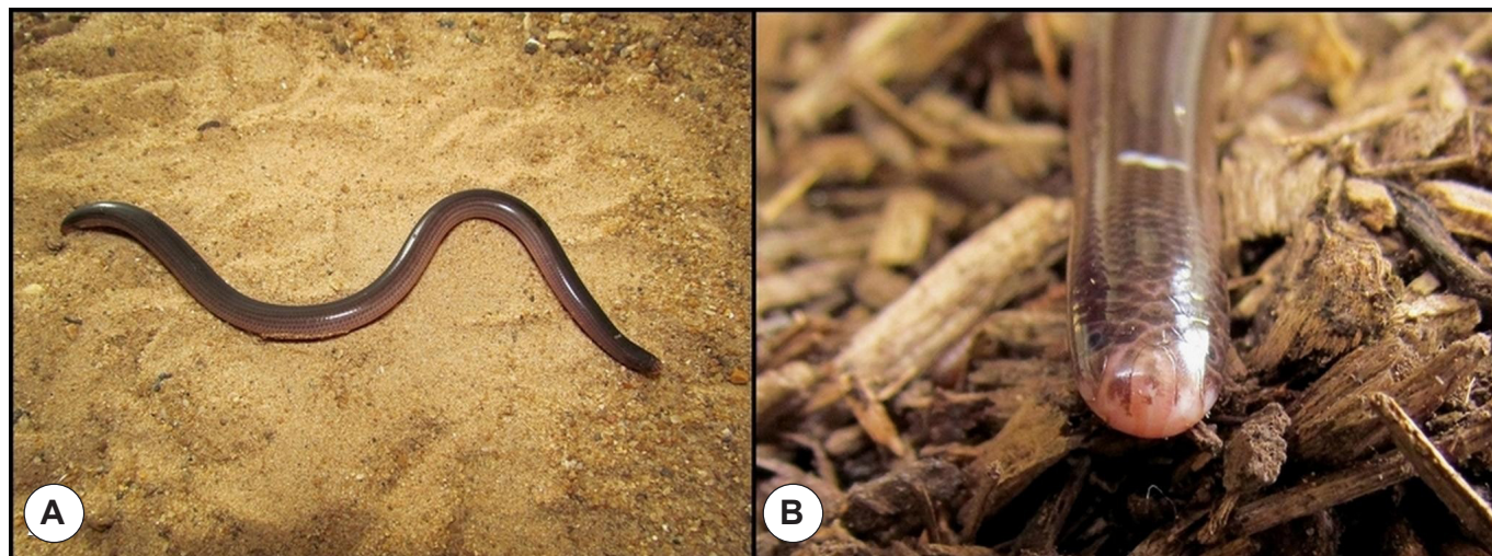
FIGURE 1. Typhlops brongersmianus (ZUEC-3541; snout-vent length 205 mm; tail length 5 mm). Dorsal (A) and head (B) views of the specimen collected in the Jardim Botânico, municipality of Bauru, São Paulo, Brazil.

We report here on the first record of T. brongersmianus in midwestern region of the state of São Paulo, southeastern Brazil, in the municipality of Bauru, where the predominant vegetation is cerrado (the Brazilian savanna), with small areas of seasonal semi-deciduous forest (a subtype of Atlantic forest) (Nóbrega and Prado 2008). The species was encountered during fieldwork conducted in the region from September, 2010 to February, 2011, with a sampling effort of five days per month. Three specimens were observed in total in two localities separated by only 3.5 kilometers. The first site is located in Jardim Botânico,