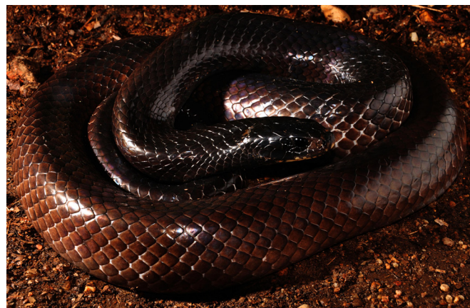
FIGURE 1. Adult male Hydrodynastes melanogigas collected in the municipality of Carolina, Maranhão.

Specimens were deposited at the herpetological collection of the Museu Paraense Emílio Goeldi (MPEG 24383 and 24384). This is the first record for the state of Maranhão and corresponds to the northernmost limit of this taxon, extending ca. 350 km N-NE from the municipality of Lajeado, Tocantins state (Figure 2) (Franco et al. 2007).