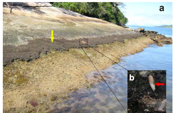
FIGURE 1. A) Intertidal vermetid at low tide (yellow arrow); B) The invasive bivalve Myoforceps aristatus inside the vermetid structure (red arrow).

da Pitanga (23°01'4.91" S, 44°26'8.34" W), Ponta da Fortaleza (22°59'51.98" S, 44°25'31.28" W), Ilha Itanhangá (22°59'23.74" S, 44°24'33.96" W), Ilha Cunhambebe Grande (22°58'9.78" S, 44°24'54.26" W), Ilha Aleijado (22°58'2.23" S, 44°22'12.46" W), Ilha Capítulo (22°58'40.04" S, 44°20'21.51" W), Ilha Coqueiros (22°59'2.76" S, 44°21'6.17" W), Ilha Calombo (23°1'31.90" S, 44°18'34.28" W), Ilha Peregrino (23°01'36.60" S, 44°17'8.64" W), Ilha Cavaco (23°00'50.98" S, 44°16'9.90" W), Ilha Saracura (23°03'14.34" S, 44°16'8.91" W), Ponta Escalvada (23°01'59.71" S, 44°22'48.26" W), Ilha do Brandão (23°1'34.12" S, 44°24'1.32" W), Ilha de Búzios (23°3'27.59" S, 44°25'2.89" W), São Gonçalinho (23°03'4.80" S, 44°36'48.85" W) e Praia dos Coqueiros (23°02'14.89" S, 44°33'15.31" W); Praia do Morcego (23°07'49.95" S, 44°08'58.03" W), Ponta da Enseada (23°06'8.87" S, 44°11'27.61" W), Guriri (23°10'24.26" S, 44°05'33.33" W) and Enseada de Palmas (23°9'4.40" S, 44°07'9.56" W); Saco do Bom Jardim (23°13'13.35" S, 44°40'46.74" W) and Praia Vermelha (23°11'22.10" S, 44°38'38.24" W).