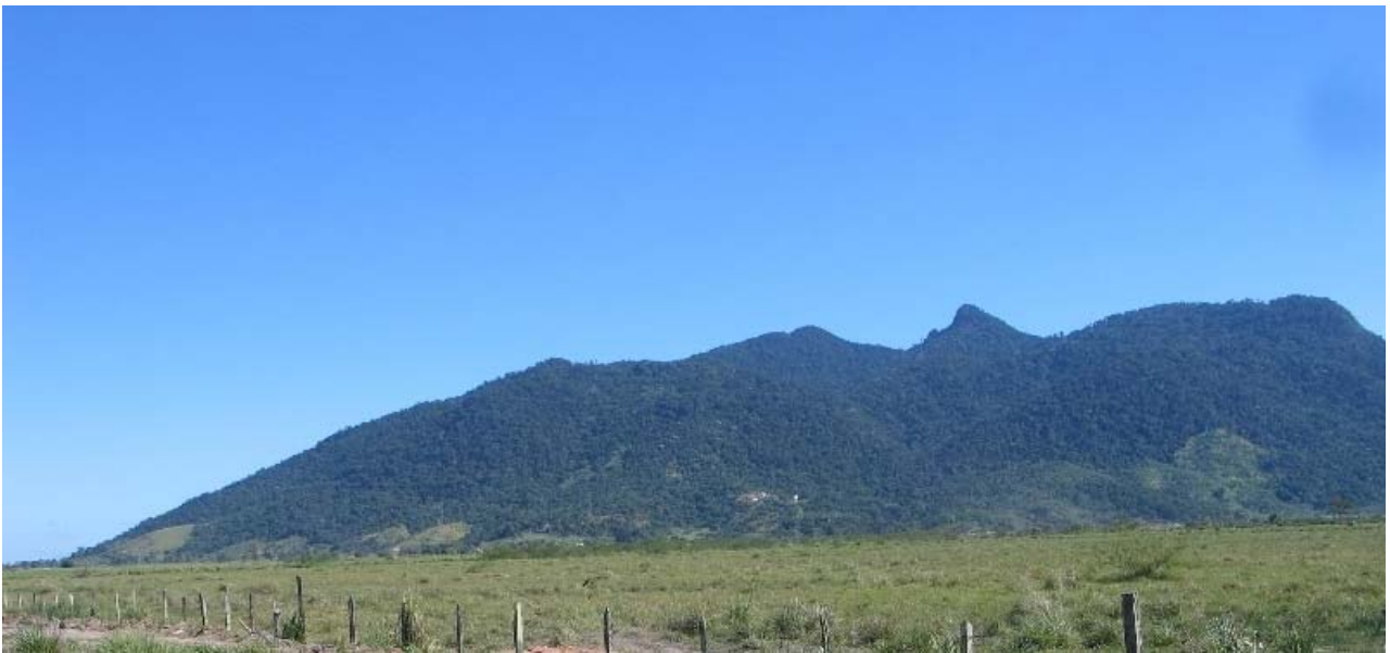
Figure 1. View of the Morro São João, in Casimiro de Abreu, state of Rio de Janeiro.