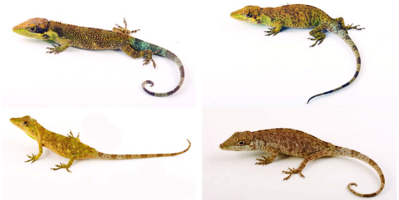
FIGURE 1. Anolis heterodermus from Ecuador. Upper left: male, QCAZ 8754 (SVL = 75.73), upper right: female, QCAZ 8721 (SVL = 73.12), lower left: female, QCAZ 8755 (SVL = 75.87), lower right: female, QCAZ 8756 (SVL = 75.78).

One of the most common high-altitude lizard species in Colombia is Anolis heterodermus Duméril, 1851, which has been subject to ecological (Miyata 1983), behavioral (Kästle 1965; Jenssen 1975; Lombo 1989), and reproductive (Ramírez-Pinilla et al. 1989; Ramírez-Perilla et al. 1991) studies. Herein we report the first record of A. heterodermus (Figure 1) for Ecuador based on four specimens (QCAZ 8721, 8754–56) collected in Chilmá Bajo (0°51'53,82" N, 78°2'59,23" W, 2,071 m), province of Carchi, between 21–26 February 2009. This locality lies approximately 120 km NE from the nearest record (ICN 10595–6, departamento Putumayo, municipio de Santiago, Colombia) of A. heterodermus reported in the literature (Figure 2; Mueses-Cisneros 2006). Our specimens are