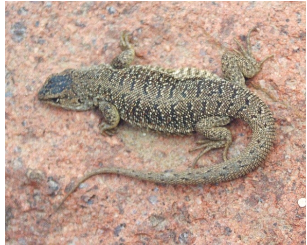
Figure 1. Adult male of Liolaemus somuncurae from the new locality: Department of 25 de Mayo, Province of Río Negro, Argentina.