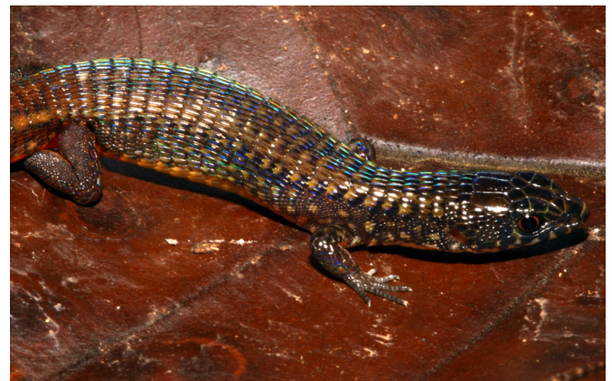
FIGURE 2. Adult Arthrosaura reticulata (UFMT 8371) collected in Cotriguaçu municipality, state of Mato Grosso, Brazil.