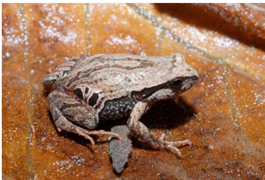
Figure 1. Adult female of Physalaemus erythros (MNRJ 55001; SVL = 23.3 mm) from RPPN Serra do Caraça, municipality of Catas Altas, state of Minas Gerais, southeastern Brazil.

On 30 October 2008, we collected a gravid female of P. erythros , snout-vent length 23.3 mm (Figure 1), at the edge of Córrego Verruguinha , Reserva Particular do Patrimônio Natural Serra do Caraça (RPPN Serra do Caraça) , municipality of Catas Altas (20°08'28" S, 43°28'5" W; 1676 m above sea level), state of Minas Gerais. The habitat is a small river in an altitudinal rocky field plateau (a typical Brazilian campo rupestre ). The river has a rocky bed and forms some pools and small waterfalls. The sparse vegetation consists of small trees and grasses. Other species occurring in the area are Bokermannohyla martinsi (Bokermann, 1964), Vitreorana eurygnatha (A. Lutz, 1925), and Iscnocnema aff. lactea .