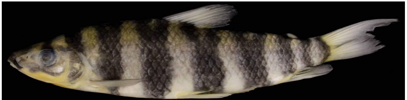
FIGURE 1. Specimen of Leporinus tigrinus , NUP 14407, 180.6 mm SL, collected in the Sucuriú River.

had restricted the distribution to the Araguaia/Tocantins basins. However, this species had already been registered from the Upper Paraná River basin, in the region of the Corumbá dam by Pavanelli et al. (2007), but it is important to point out that this record is based on the presence of only one juvenile specimen captured in approximately five years of surveys performed by the Núcleo de Pesquisas em Limnologia, Ictiologia e Aquicultura (Nupélia). Although the Upper Paraná River basin is considered the most sampled area for freshwater fish fauna in Brazil (Agostinho et al. 2007), this species has not been registered again until now. However, other two additional species were found in the fish collection of the Nupélia, both from Claro River, a tributary to Paranaíba River, Goiás State, approximately 390 km away from the Corumbá Reservoir region. Langeani et al. (2007) considered L. tigrinus as a native species to the Upper Paraná River basin, but without any justification, probably using the information from Lima (2004) on the type-locality of the material collected in Thayer Expedition, wherein the holotype of L. tigrinus was captured. Nevertheless, Britski and Garavello (2007) had cited the distribution of L. tigrinus only for the Tocantins River basin, which includes the Araguaia River basin. Thereby, the scope of this study was to extend the current