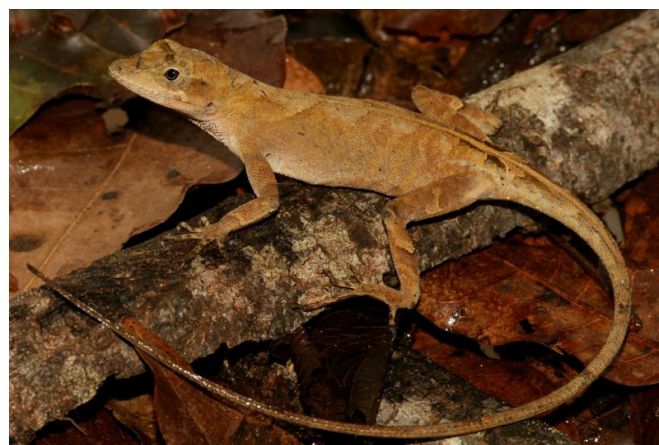
FIGURE 3. Adult female (CRIB 0700) of Anolis chrysolepis captured at the Estação Ecológica de Bauru, municipality of Bauru, state of São Paulo, Brazil.

Specimens collected at the Estação Ecológica de Assis, municipality of Assis, and Estação Ecológica de Bauru, municipality of Bauru (collection permit SISBIO-IBAMA nº 10423-1) are deposited in the Coleção Herpetológica “Alphonse Richard Hoge”, Instituto Butantan (IBSP), state of São Paulo, Brazil (Table 1).