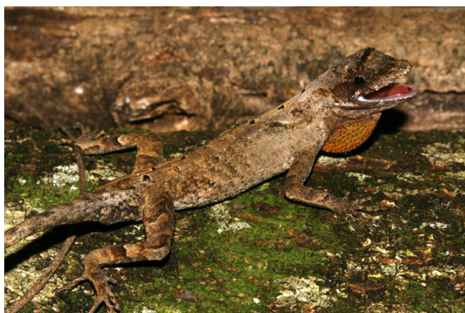
FIGURE 2. Adult male (CRIB 0699) of Anolis chrysolepis captured at the Estação Ecológica de Bauru, municipality of Bauru, state of São Paulo, Brazil.

for the municipalities of Américo Brasiliense (ZUEC 1358), Araçatuba (MZUSP 04365), Araraquara (MZUSP 04384), Itapura (MZUSP 00551) and Vista Alegre do Alto (MZUSP 04383). The record at the Estação Ecológica de Assis provide a southward range extension (approximately 150 km) from the nearest known occurrence (municipality of Araçatuba, northwest of the state of São Paulo) and an eastward range extension (approximately 200 km) from the municipality of Teodoro Sampaio (Dixo et al. 2006) in the extreme west of the state of São Paulo (Figure 1). The record at the Estação Ecológica de Bauru extends the