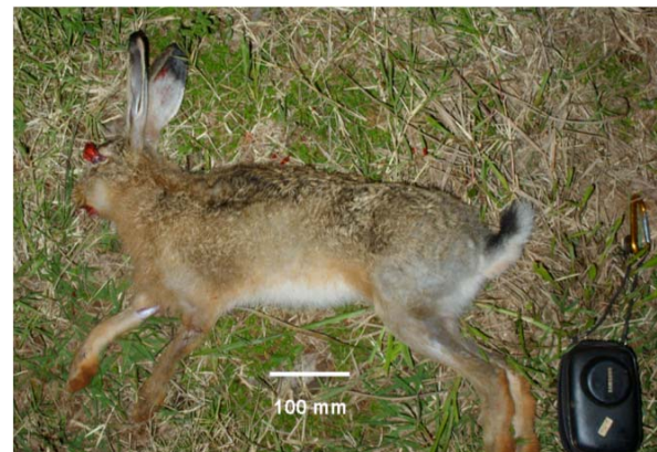
Figure 1. First confirmed record of the invasive European hare for Paraguay. Size of the documented record overlap with ranges reported in the literature by Peterson, 1966; Hall and Kelson, 1959, and share the large black tips ears, the black topped and white-bottomed tail, long legs, and white venter characteristic of L. europaeus .

notch: 94-102 (average 98); Tail (T) 72-110 (average 95); and Hind foot (HF) 142-161 (average 151) (Peterson, 1966; Hall 1981); meanwhile, our specimen's measurements are TL 635, EL 120, T 87, and HF 147 (Table 1), which coincide well with those previously published for L. europaeus . Additionally, they are considerably larger than published measurements for S. brasiliensis (Linnaeus, 1758) (Redford and Eisenberg 1992, Emmons 1997), a native lagomorph (Myers et al. 2002), of considerably smaller size, with pure russet ears (which are relatively short for a rabbit) and a small inconspicuous tail (Emmons 1997).