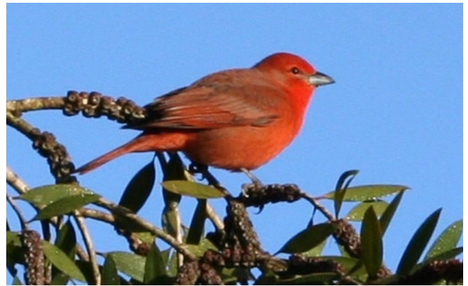
FIGURE 3. Piranga flava (male) photographed in the municipality of Capão do Leão, southern Brazil.

In Rio Grande do Sul, P. flava is considered a summer resident that migrates northward after the breeding season (Belton 1994; Bencke 2001). Our study presents recent records covering all seasons and demonstrates that