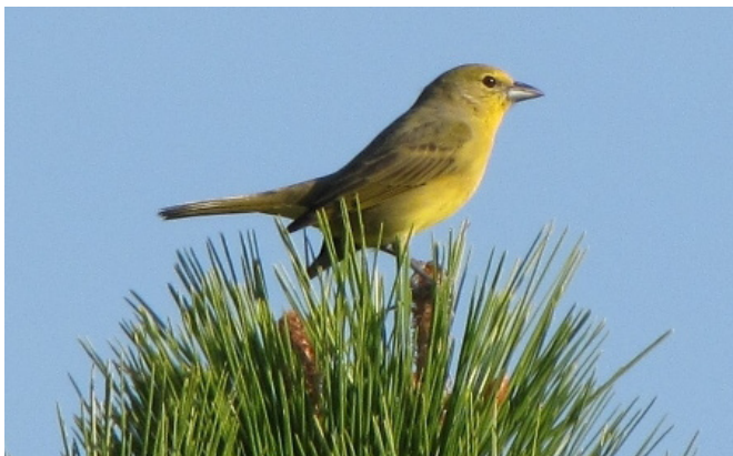
FIGURE 2. Piranga flava (female) photographed in the municipality of Pelotas, southern Brazil.

In addition to these specimens, we obtained 19 recent records of P. flava (Figures 2 and 3) between December 2008 and October 2010 in the southeastern Rio Grande do Sul (Table 1; Figure 4). Fifteen recent records were at the Campus Universitário of the Universidade Federal de Pelotas (UFPEL), one in the Área de Proteção Ambiental Dunas, one on the edge of a woodland patch in the Horto Botânico Irmão Teodoro Luís of UFPEL, one in a riparian forest along Arroio Pelotas and one in a riparian forest of Arroio Candiотinha. The first two sites are mainly urban and the other three are used for livestock grazing and agriculture. All birds were detected by means of vocalizations and 13 of these records included sightings. Thirteen records referred to solitary individuals and the other six involved two or three individuals (Table 1).