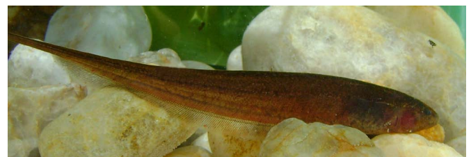
FIGURE 1. Picture of female Brachyhypopomus draco collected in a wetland area of the Lagoa do Peixe National Park, Rio Grande do Sul state, Brazil.

6 km east from the city of Mostardas in the Lagoa do Peixe National Park (LPNP) (Figure 2). Our current records extend 81 Km southeastern the previous known distribution of the species and also represent its first record in a national park located along the RS coastline (Figure 2). Individuals of B. draco were collected with a small seine net (1x1m of opening and with size mesh of 5 mm) altogether with several other species during a research field trip conducted by the Ichthyology Laboratory of the Rio Grande Federal University, FURG (SISBIO's license for field collection number 14443-1). Specimens were preserved in 10 % formalin and later identified at the Ichthyology Laboratory based primarily on Giora et al. (2008). Specimens examined were deposited at the Ichthyology Laboratory in the same university (catalogue number FURG2186).