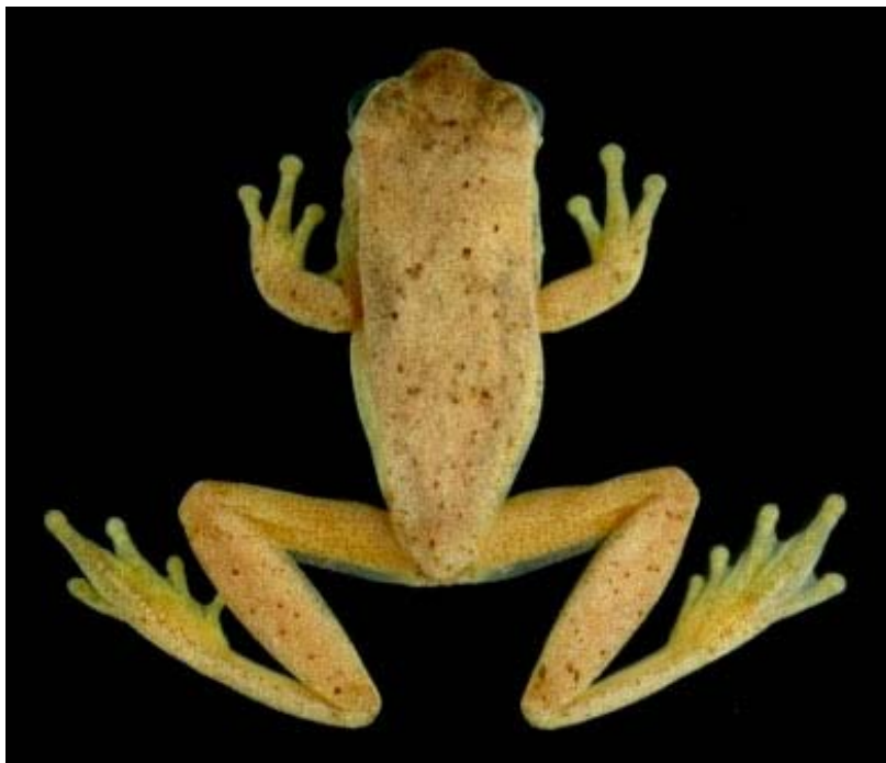
Figure 1. Dorsal view of Dendropsophus pseudomeridianus , male from the municipality of Mimoso do Sul, state of Espírito Santo (ZUFJRJ 10224; snout-vent length 20 mm).

Voucher specimens were deposited in the Amphibian Collection of the Departamento de Zoologia, Universidade Federal do Rio de Janeiro, Rio de Janeiro, RJ, Brazil (ZUFJRJ 10220-10230).