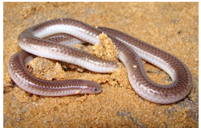
FIGURE 1. Specimen of Siagonodon brasiliensis collected in João Pinheiro, Minas Gerais, Brazil.

(a phytofisionomy composed of palm Mauritia flexuosa L. f. emerging on bushes, surrounded by grasslands, which develops on hydromorphic soil - Ribeiro and Walter 1998). The area was moderately preserved, despite being near the municipality of João Pinheiro. The specimen was deposited in the Coleção de Répteis do Museu Nacional/Universidade Federal do Rio de Janeiro (MNRJ 17802).