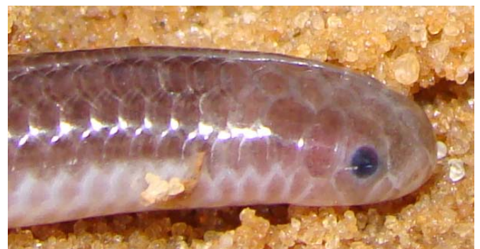
FIGURE 2. Head details of the Siagonodon brasiliensis specimen collected in João Pinheiro, Minas Gerais, Brazil.