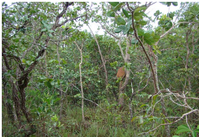
FIGURE 3. Cerrado stricto sensu where Siagonodon brasiliensis was collected in João Pinheiro, Minas Gerais, Brazil.

The record on João Pinheiro extends the known distribution of S. brasiliensis about 100 km northwest of Três Marias (Figure 4). The habitat where S. brasiliensis was collected in João Pinheiro is very similar to that of the snake recorded at the Estação Ecológica de Uruçuí-Una, state of Piauí. Like in Barreiras, state of Bahia, and Três Marias, state of Minas Gerais, all these sites are situated in highland plateaus with sandy soils covered by Cerrado stricto sensu . This suggests that the species may be specialized to that kind of habitat.