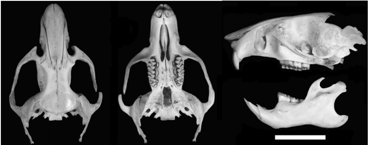
Figure 1. Anterior portion of skull (from left to right: dorsal, ventral, and lateral views) and left mandible in lateral view of Loxodontomys micropus obtained from Barn Owl pellets from the province of Chubut, Argentina (CNP-E 174). Scale = 10 mm.