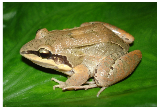
FIGURE 1. Adult male of Leptodactylus mystaceus in life, collected at Cesumar Farm, municipality of Maringá, state of Paraná, Brazil.

We recorded the longitudinal expansion of the geographic distribution of L. mystaceus in approximately 550 km to the west, and its occurrence in the state of Paraná and the south region of Brazil, information that increases the ecological database for the herpetofauna of Paraná.